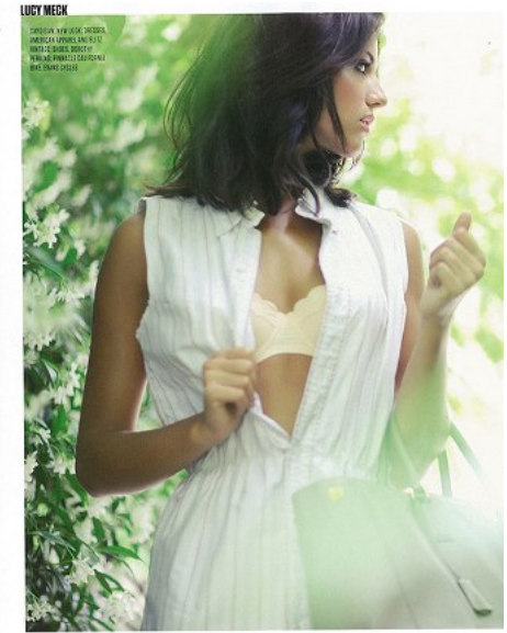
064 PINK OCTOBER 2010